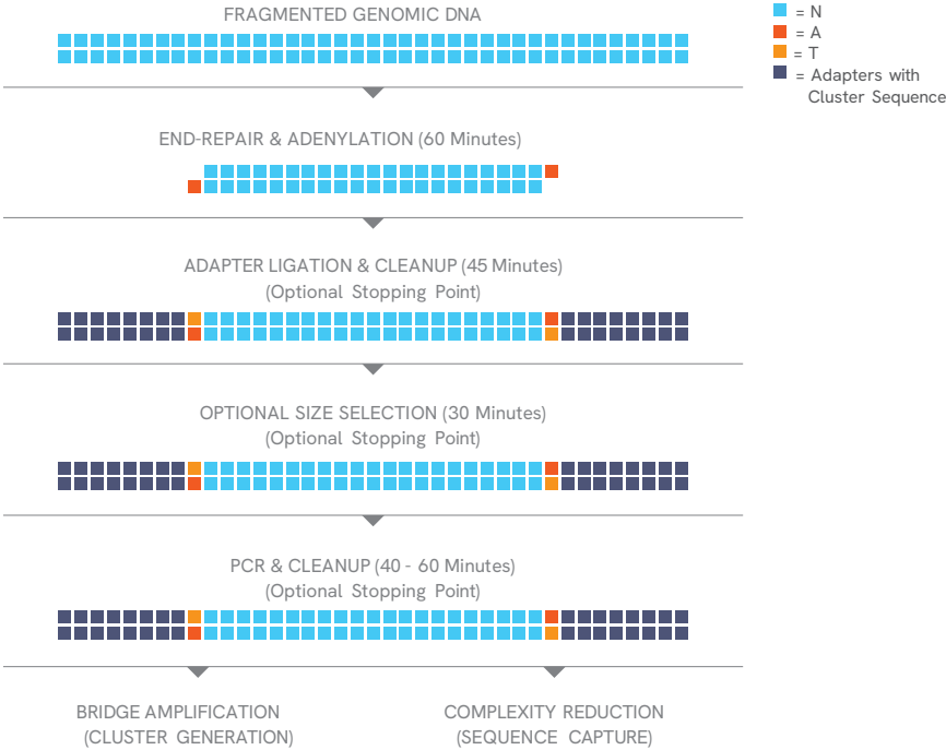
Figure 1: Sample flow chart with approximate times necessary for each step.